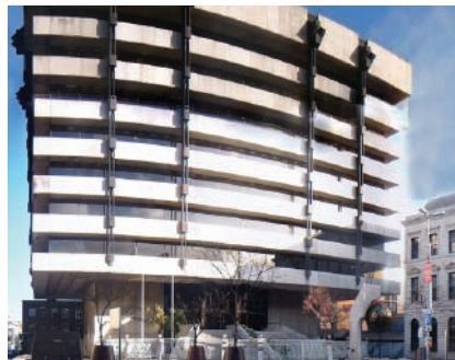
CC Creative Commons: Photo by Doyle/ 79

dangers of assuming that households with mortgage accounts 'performing' as per the restructured agreement are not in great financial difficulty. It is vital to remember that these accounts have been renegotiated as a result of financial distress. Therefore, by adding the number of mortgages in arrears to those restructured but performing