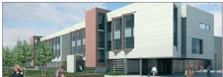
Sketch of UCD's planned new law building

PILA is working to expand clinical legal education in Irish law schools. UCD School of Law is introducing a number of clinical elements to its undergraduate law programmes. These range between modules addressing clinical themes (such as in the theory of court practice) through to more experiential learning in fields such as advocacy and